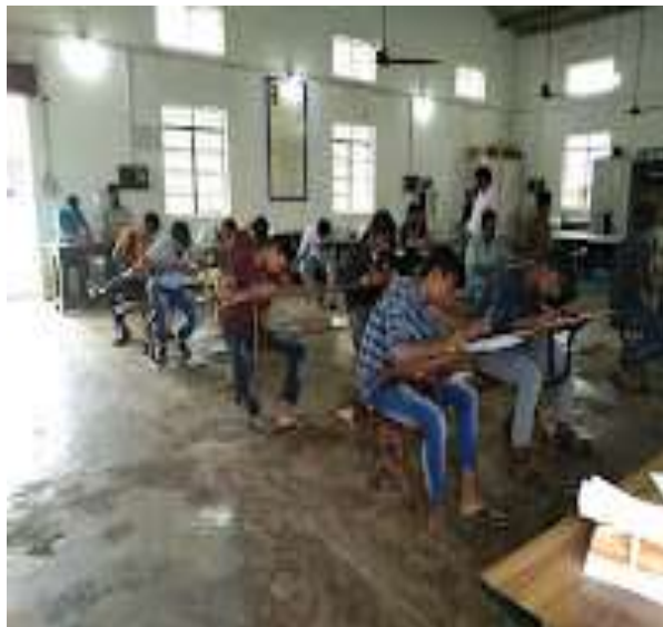
First internal test - 33rd batch trainees: Aug