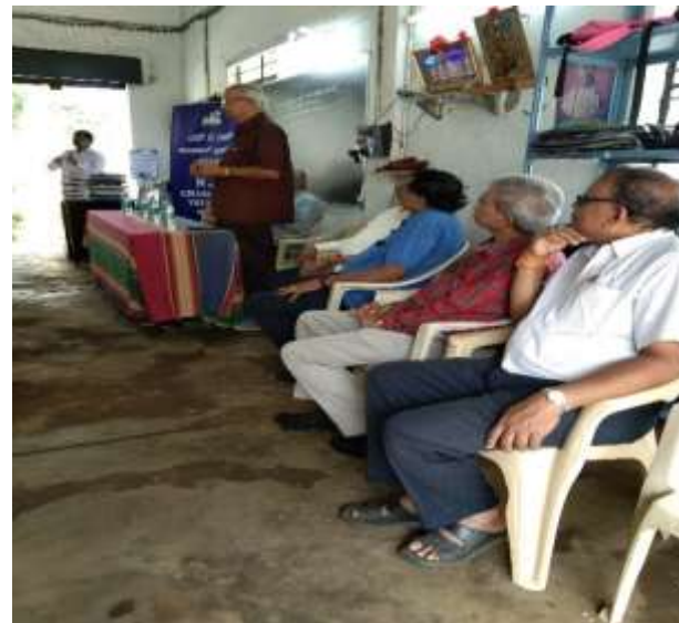
NJS Charitable Trust donated stationeries: Aug