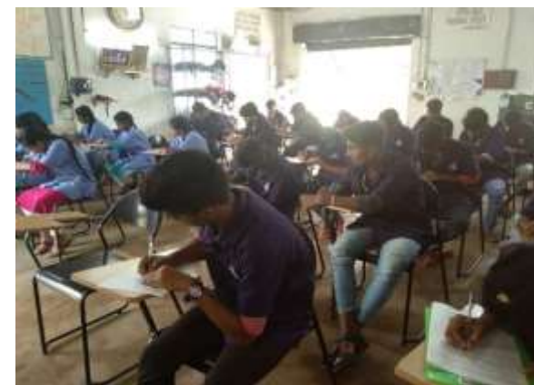
32 nd batch final exams: June