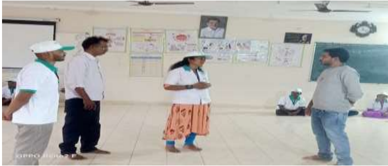
Animal Husbandry training, SBI RUDSETI- Mysuru: April