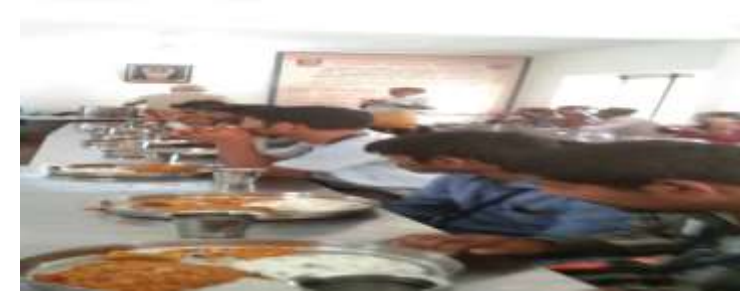
Midday meal sponsors: April