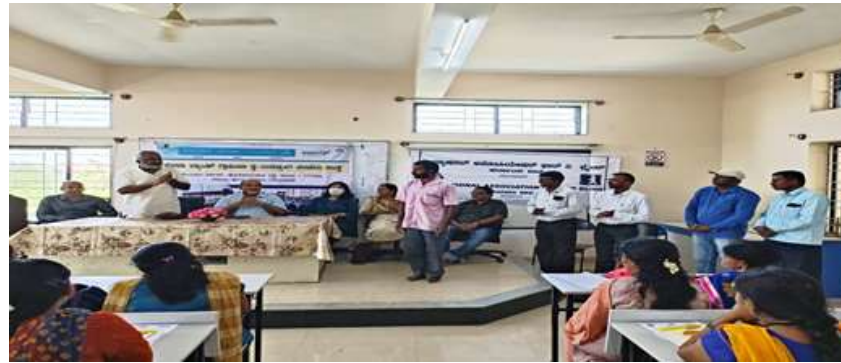
Animal husbandry trg, Canara Bank RUDSETI-Hassan: April