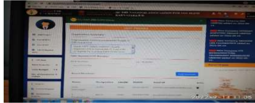
National CSR Registration: August