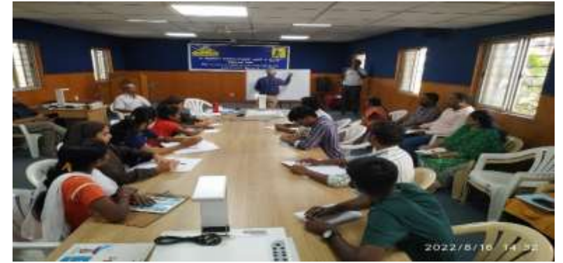
UREAD training workshop for trainers: August