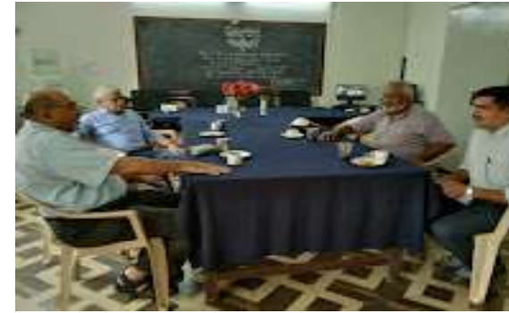
GC Members visit: May