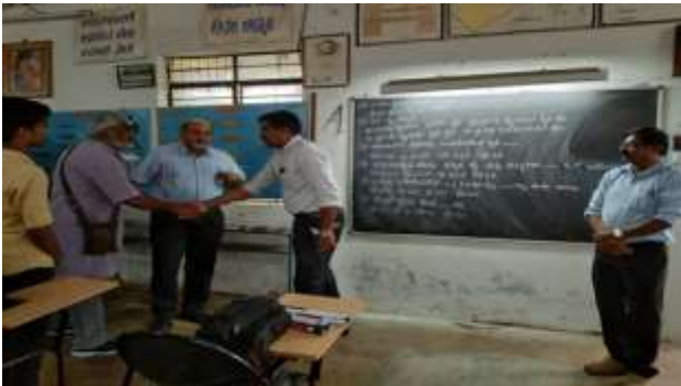
Visit by Schevaran Chemicals: May