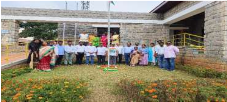
313th Mobility Grad day+ Independence Day: Aug