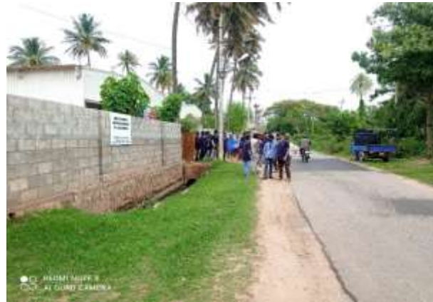
Industrial visit by 32 nd batch: June