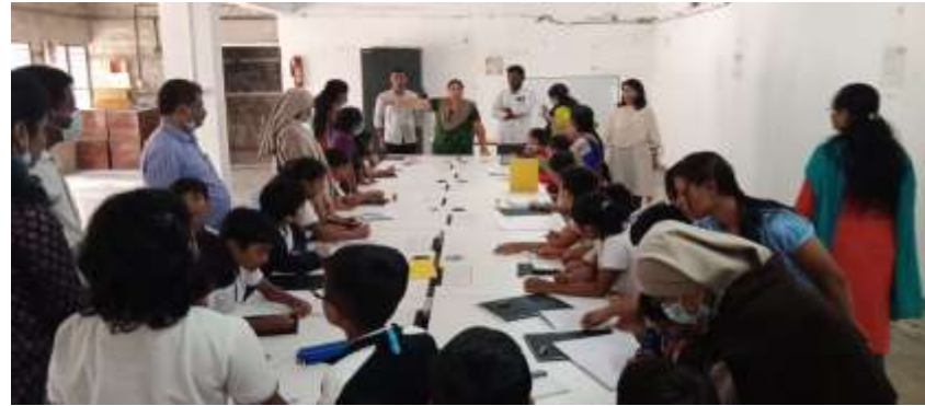
Sensitization Program - New Horizon Intl school, Hennur: Aug