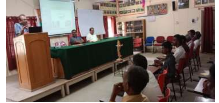
Training by Animal Husbandry Dept, Tumkur: April