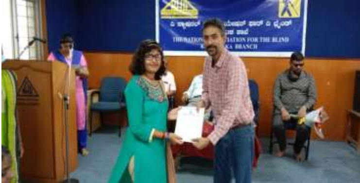
Basic Computer Grad day - 47 th batch: July