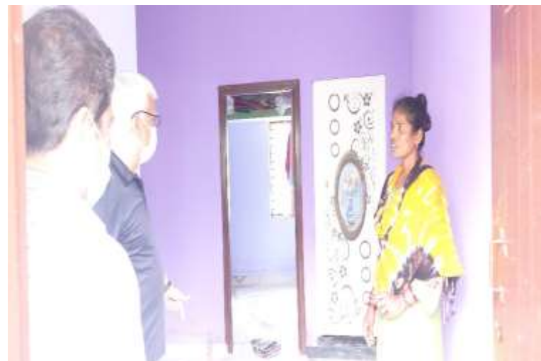
Sorterz - Free accommodation