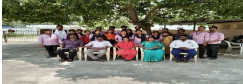
Helen Keller Govt Teachers Trg Center visit: April