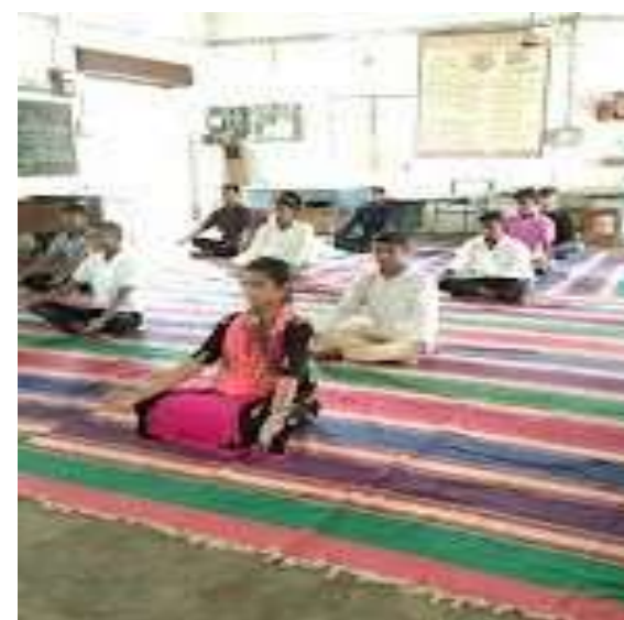
Yoga Classes: Every Wednesday