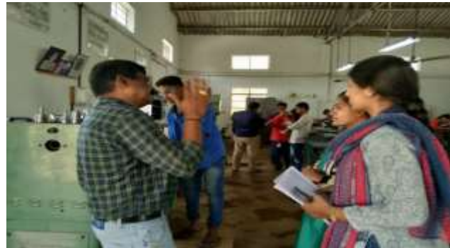
Vidya Vikas College- MSW students visit: May