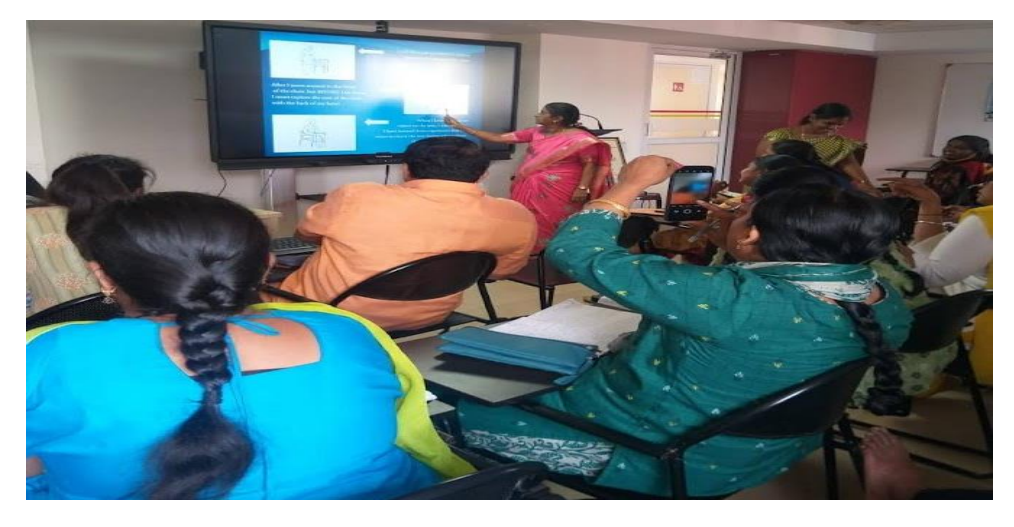
One day Workshop on 'Orientation and Mobility " for the 3rd Batch of RCI-CBID trainees @ CBM India Office, Chamarajanagar on 22 Feb 2024,

1. CBM India Trust - works with people with disabilities, their representative organisations, community-based organisations, institutions with local, state & central Government. NABK staff conducted one day Workshop on 'Orientation and Mobility.