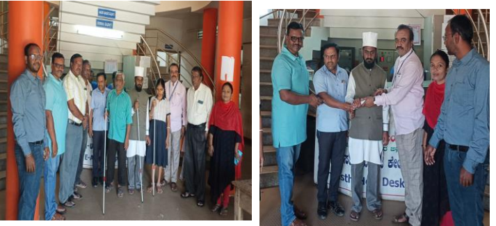
@ Hospet by City Commissioner Officer