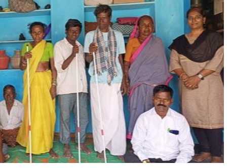
Gadhar Village, Raichur Taluk,