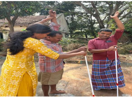
5 days Training at Nanjangud