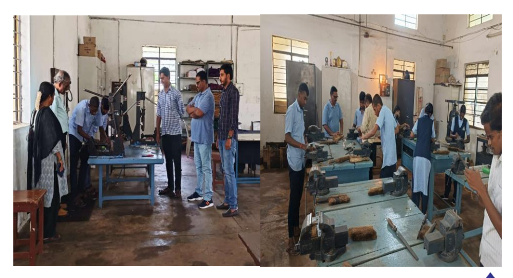
Hellen Keller Govt Teacher Training Centre Coordinator and Students visited on 21<sup>st</sup> Feb 2024