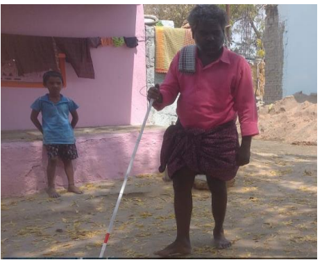
5 day @ Raichur, Arshanagi Village