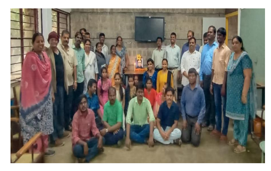
Louis Braile Day was celebrated at NABK on 4<sup>th</sup> Jan 2024