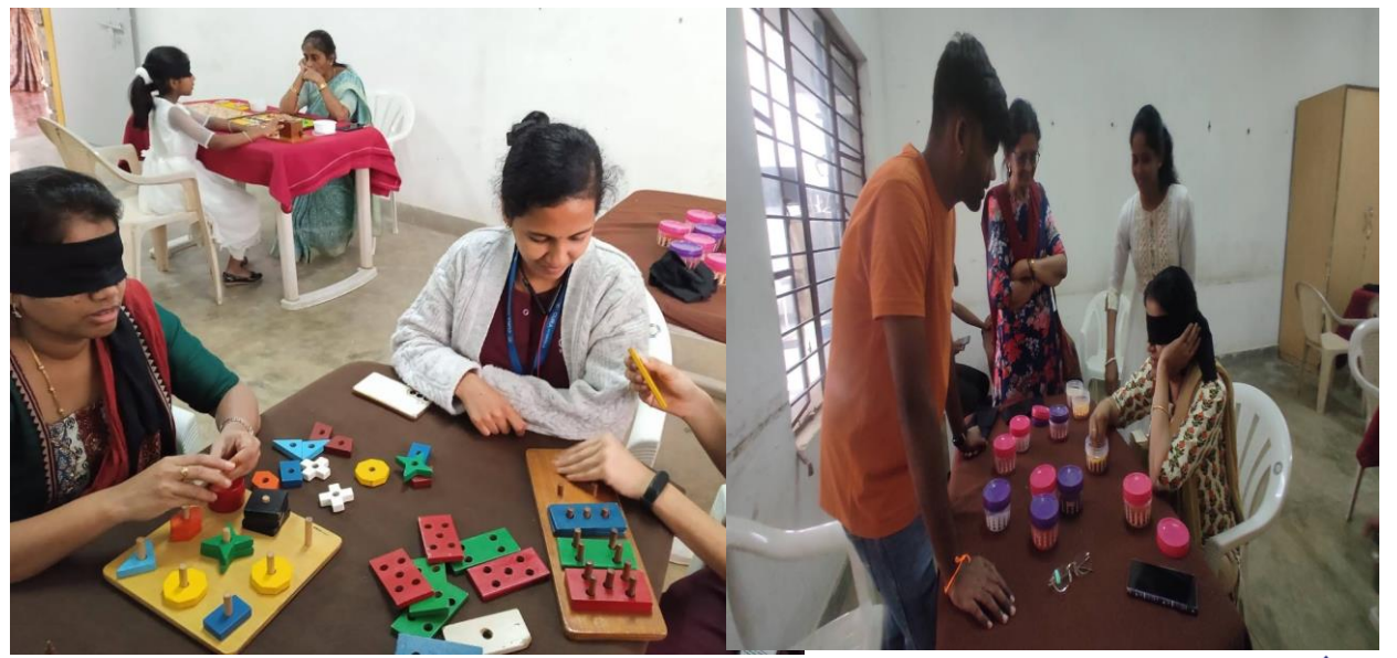
Outreach day was organized at NABK & 8 participated in the Sensitization Program on 20<sup>th</sup> Jan 2024