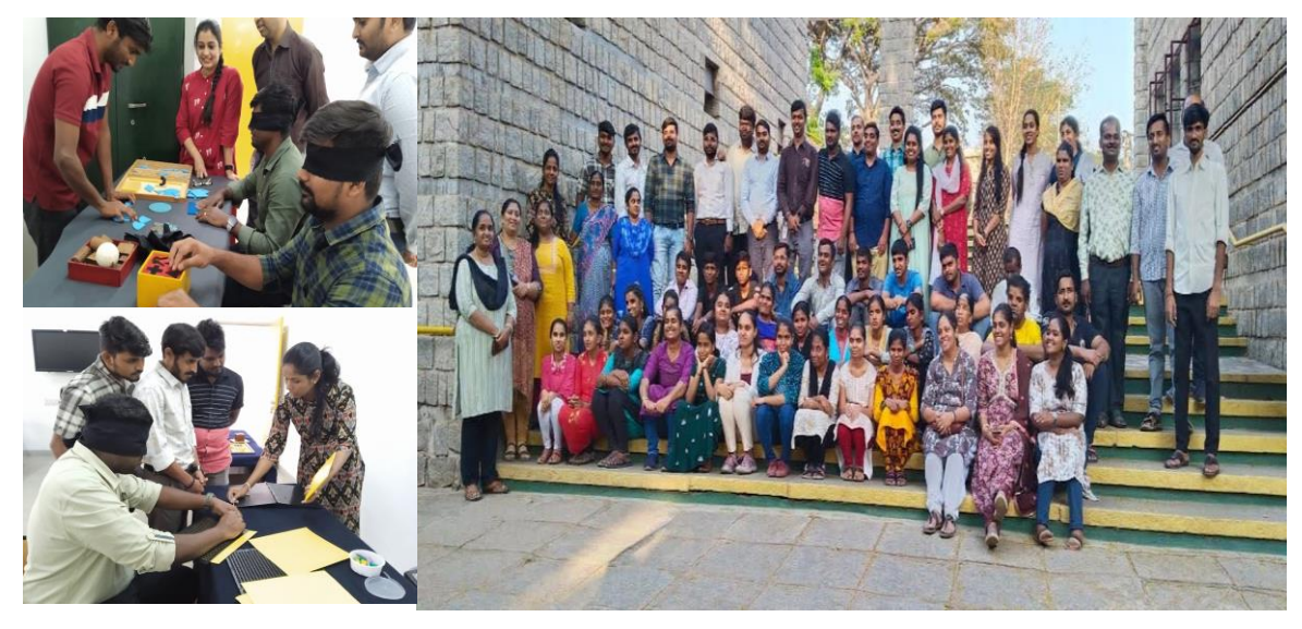
LDRA team visited NABK had lunch with our students and participated in the Sensitization Program on 31<sup>st</sup> Mar 2024