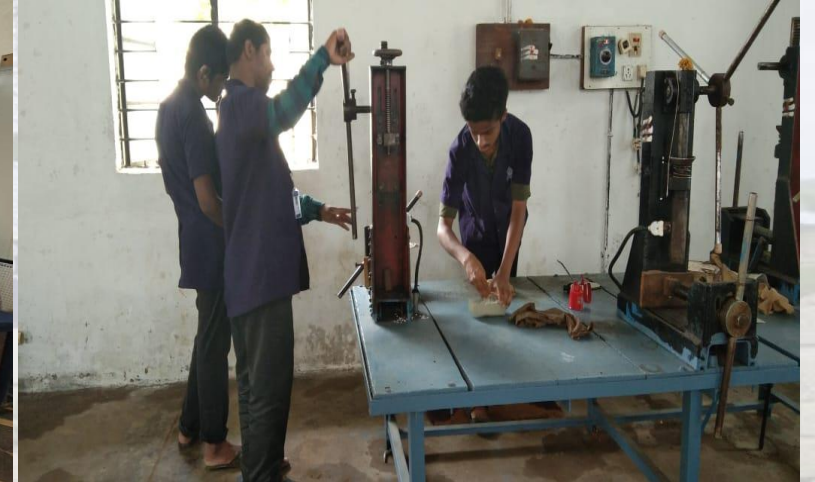
Trainees - Hearing-Impaired students practicing threading the pipes.