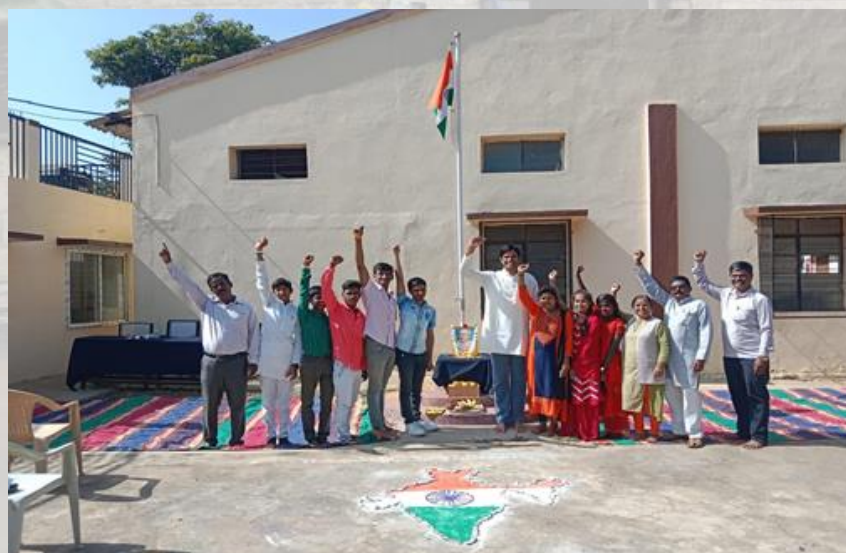
Independence Day Celebration at NAB (Mysuru).