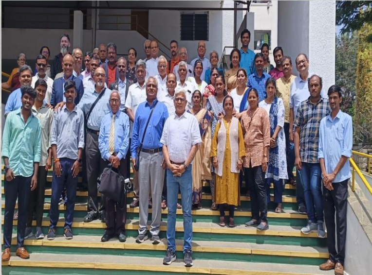
46th Year Annual General Meeting