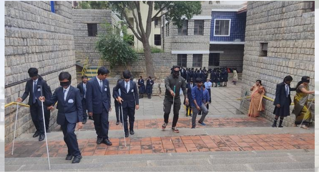
Students of St. Philomena's English School, Vidyaranyapura, visited NABK and participated in the Sensitization Program.