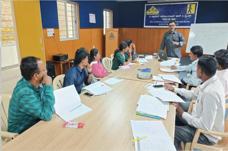
New CBR Team was oriented and trained on 29 th & 30 th September at NABK, followed by a Sensitization Program.