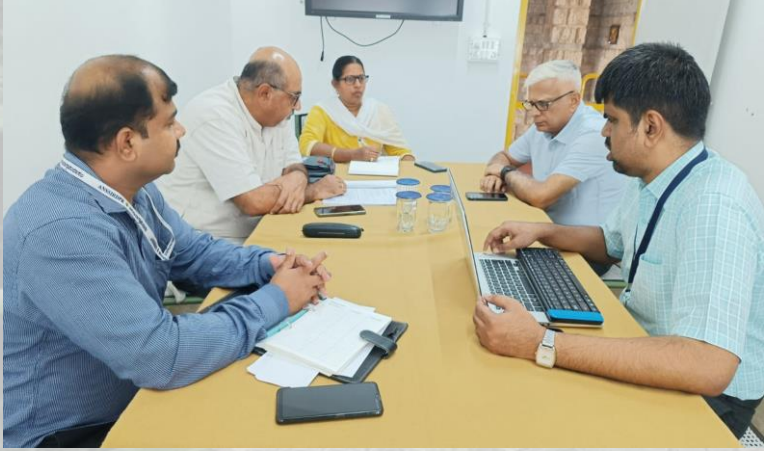
Meeting with Rural Development and Panchayat Raj Department at NABK to discuss on upcoming project - Usage of Assistive Devices in Rural Libraries.