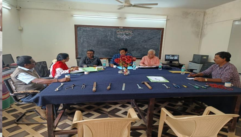
Selection Committee for 34 th ITI batch training, Interviews were conducted by GC members & NABK staff