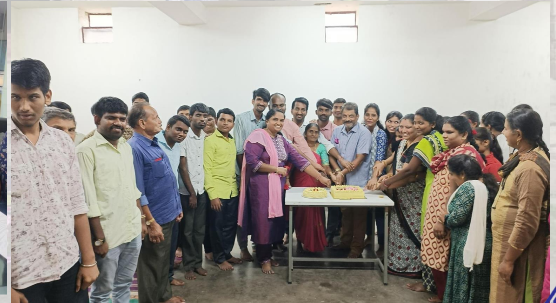
Teachers Day Celebration at NABK, Students dedicated performances and speeches to the NABK staff and teachers