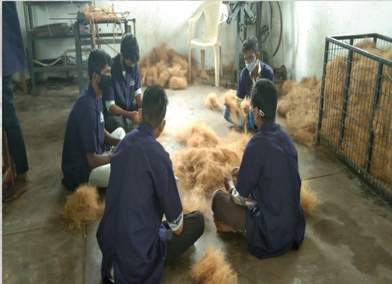
Students getting trained to make ropes, dye the ropes and make mats.