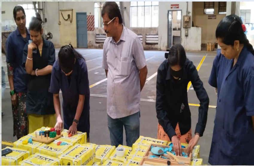
Sensitization Program at VST Warehouse for VST Co-workers