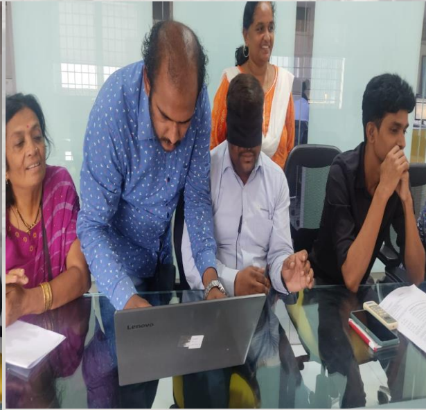
Sensitization Program at New India Electricals, co-workers partaking in sensitization Program.